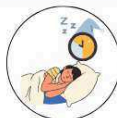
Get enough sleep