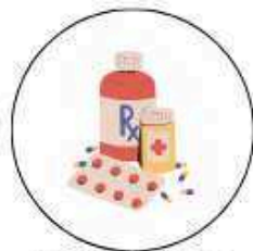
Analgesic/ pain reliever