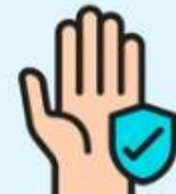
Hands are clean

Clean and Bright Keep the germs out of sight