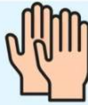
Wash your palms