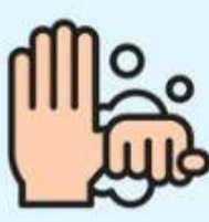
Base of thumbs