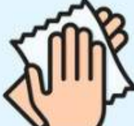
Dry hands with towel, tissue or dryer