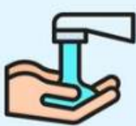
Rinse off soap with water