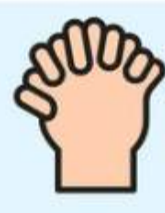
Scrub each finger