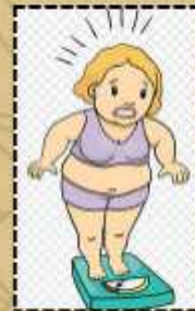
Sudden Weight Gain