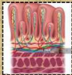
Maintenance of the gut mucosal barrier