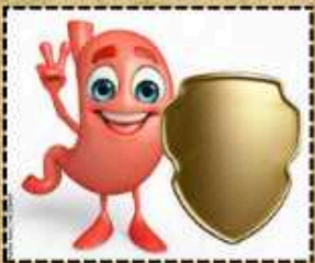
Protection against pathogens