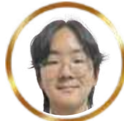
PARK ONJU GRADE 9